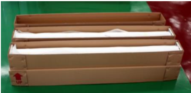
In the carton