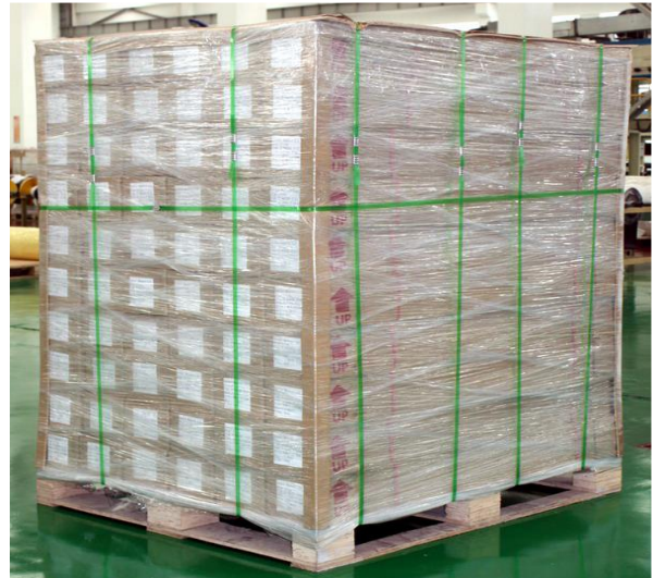
In the pallet